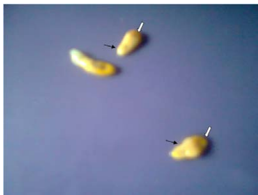
Figure 2. Live metacercariae of Clinostomum Morphotype1 showing two body colorations.

Season influenced the occurrence of Morphotype1 with higher prevalence in dry (54.01%) than rainy (45.98%) season months with highest prevalence in January, November and April (10.71%) and lowest in September (5.36%).